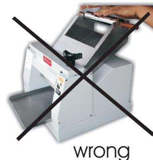
Pic - 05