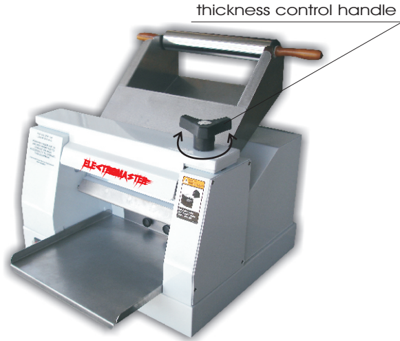
Pic - 07

In order to determine the thickness of the dough, turn the thickness control handle according to the desired measure.