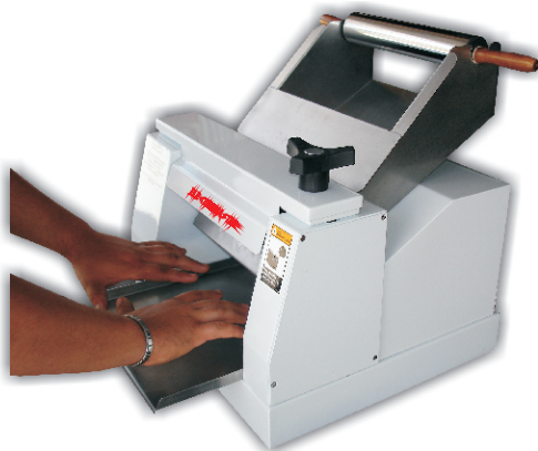
Pic - 04

First make sure the Dow Roller is firm in its position. Clean the rolls with a dry cloth and if necessary with a plastic slice.