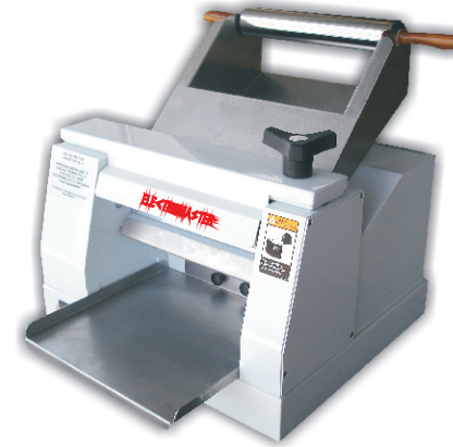
Pic - 02

Immediately unplug the machine from the outlet in case of emergency. Never turn the machine on when the reversion handle is fixed in the pinion.