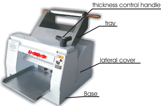
Pic - 01

Most of the components which are part of the machine, are manufactured with high performance raw materials : stainless steel, aluminum or plastic.