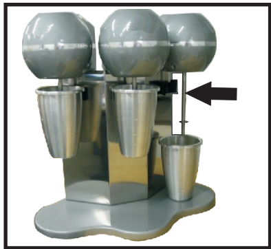
MACHINE DOES NOT TURN . 3.4 CLEANING

The Milk Shake Mixer parts are resistant to corrosion, hygienic and easily cleaned.