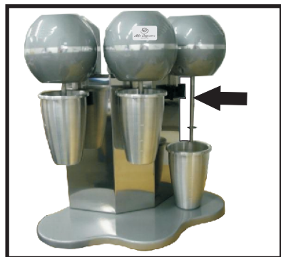
MACHINE DOES NOT TURN .