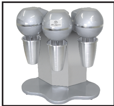
MACHINE TURNS .