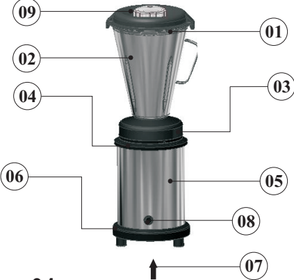
Table - 01