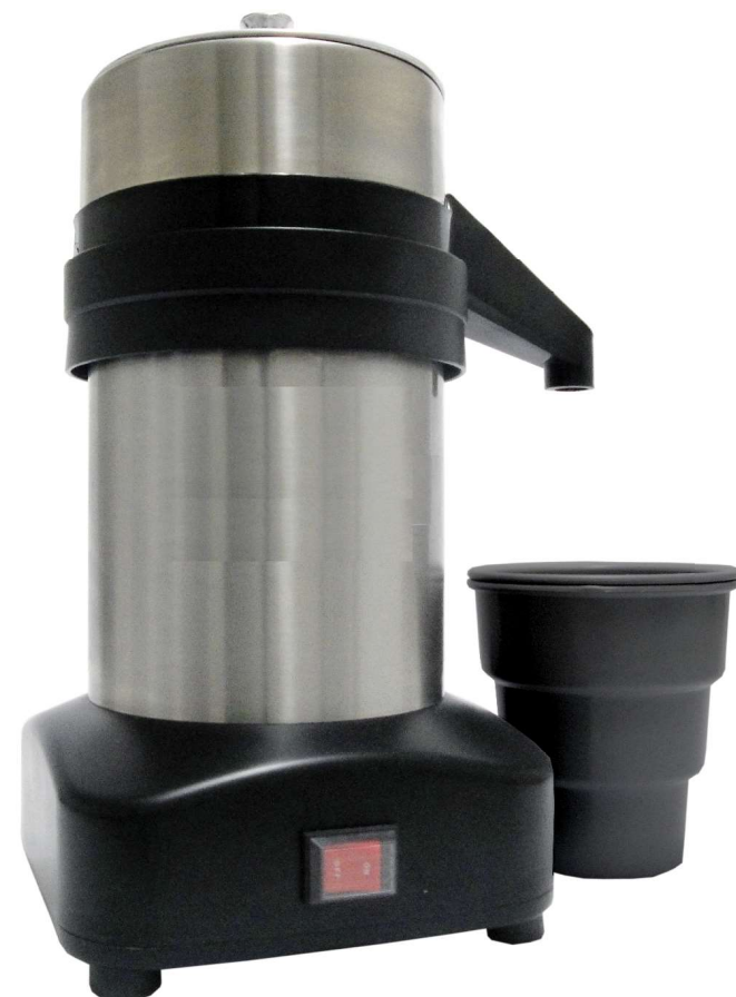
JUICE EXTRACTOR, STAINLESS STEEL, STAINLESS STEEL LIQUID CHAMBER