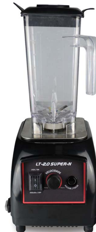
BLENDER HIGH ROTATION, POLICARBONATE CUP, WITH SPEED CONTROL